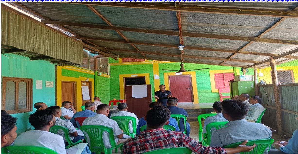
AWARENESS PROGRAMME ON DDRUGS AND HIV/AIDS