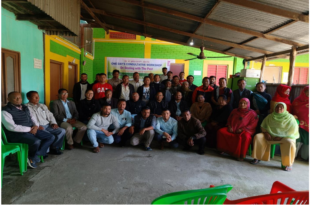
WORKSHOP ON DEALING WITH THE PAST IN MANIPUR