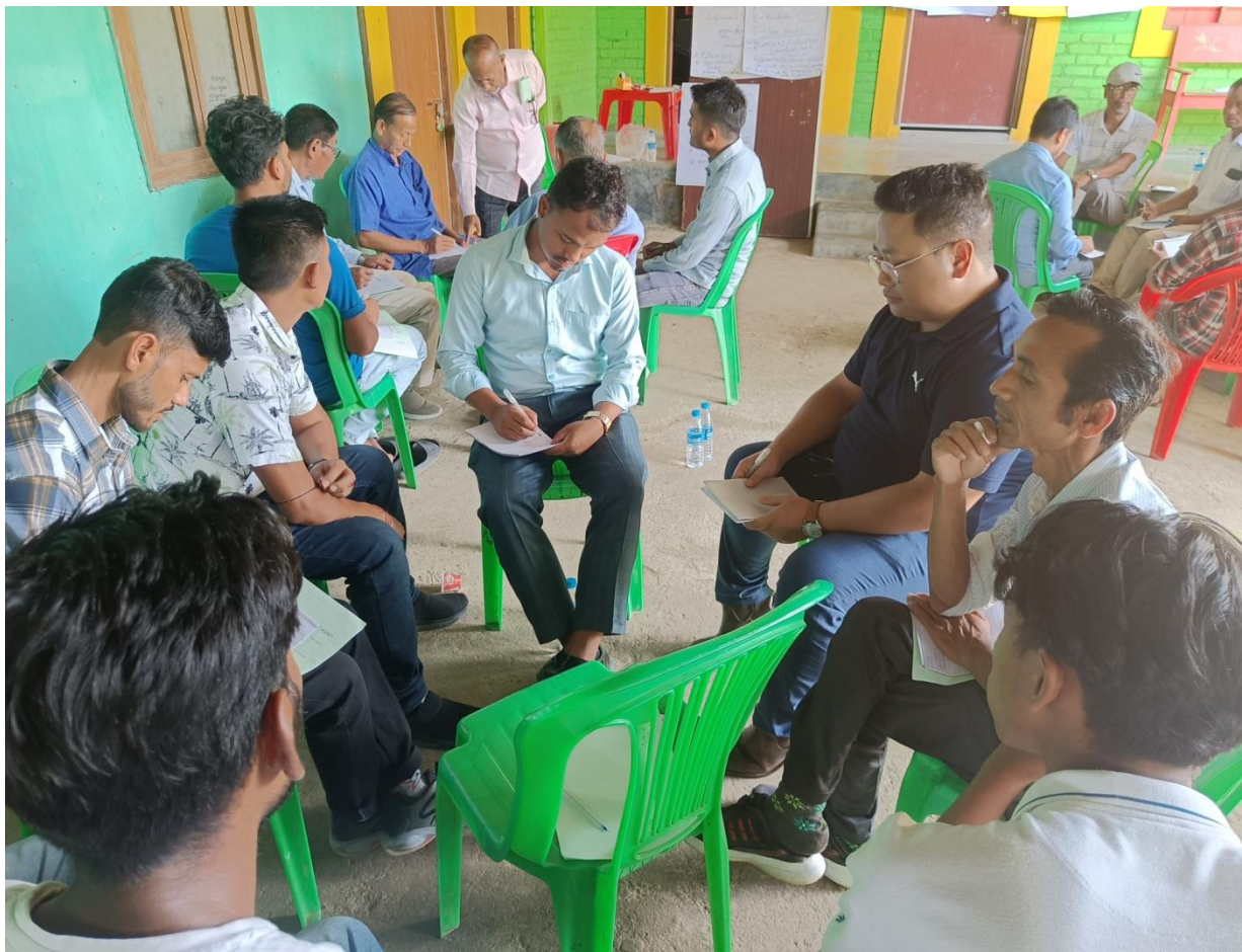
YOUTH LEADERSHIP TRAINING AT IRDA

IRDA has conducted a 2 days residential training program on “ Advance Youth Leadership. “ at the training Hall of IRDA on 6-7/03/2024 supported by PRDA, Bishnupur district, Manipur. In the programme, 42 youths have been participated.